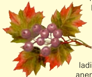
Wild Service Tree

Flowers associated with long established woodland found here, include bluebell, wood spurge, lords-and-ladies, pignut, hairy violet, wood anemone and ramsons.