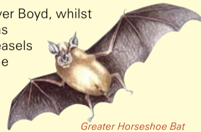
Greater Horseshoe Bat

Otters frequent the River Boyd, whilst small mammals such as hedgehogs, stoats, weasels and squirrels inhabit the reserve, together with at least eight species of bat.