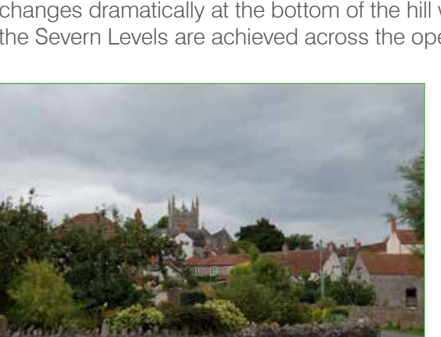
Preserve views to St Mary's Church

In comparison to the level route through the village, the lanes follow the sloping ground. Church Hill drops steeply towards the flood plain of the River Severn at its lower end, whilst Vicarage Lane rises gradually at first, before a steep climb up Fern Hill. It is thought that there may historically have been a quarry on the site of Church Hill which would explain the steepness of the slope here. The meandering nature of the lanes, their varied levels and the seemingly random orientation and layout of buildings results in a variety of spaces and a mixture of short and longer distance views. From elevated positions on Church Hill interesting framed views out to the levels can be glimpsed. The variety of both high levels of enclosure and open views also adds interest and character to the lanes. For example the wide road and verge at the top of Church Hill gradually reduces to the narrow and enclosed pinch point half way down at its steepest point, and beyond this the character changes dramatically at the bottom of the hill where extensive views towards the Severn Levels are achieved across the open fields.