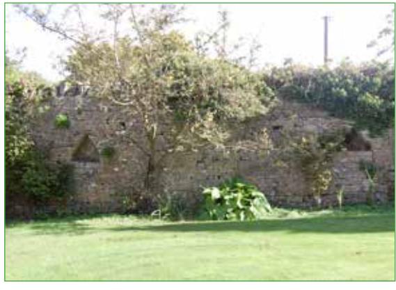
The distinctive bee boles at Olveston Court

The cumulative impact of seemingly small changes such as additional sub-division of open fields, the erection of small outbuildings, non-native planting or unsympathetic extensions and alterations to buildings can harm the unique character of the area. Due to the site's fragmented ownership, the