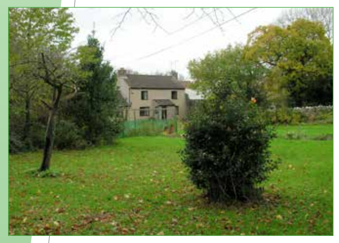
The large front gardens provide an important sense of space and tranquillity to the area and should not be developed or harmed