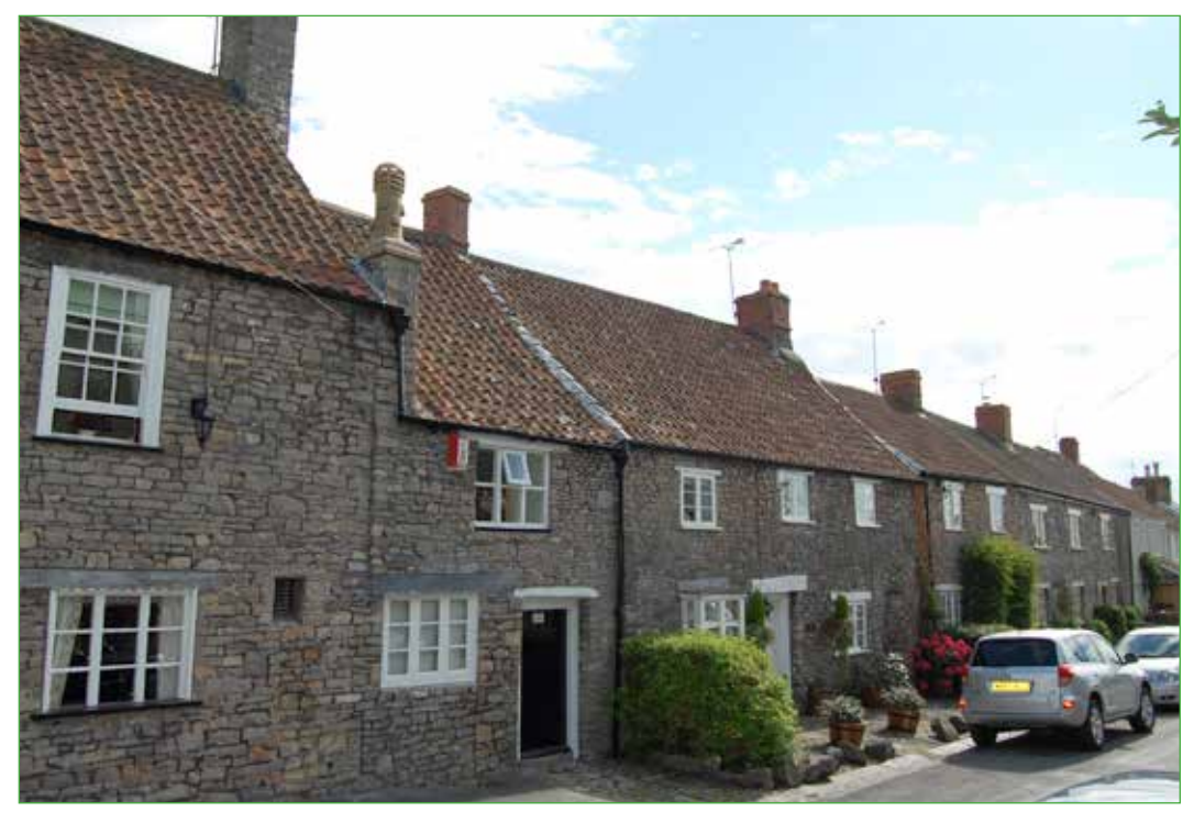
The cottages opposite St Mary's Church are reputed to be some of the oldest buildings in the village

The agricultural buildings associated with Church Farm enhance the traditional rural character and the informality of this character area. The modern cul-de-sac development at the lower end of Church Lane as well as the water pumping station, have however diminished the traditional rural character and it should be ensured that further development does not further detract from its rural character and open landscape setting. The overhead power lines on Church Hill are also particularly prominent and detract from the rural charm.