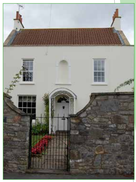
Hawkfield House is a grade II listed building of 'polite' style