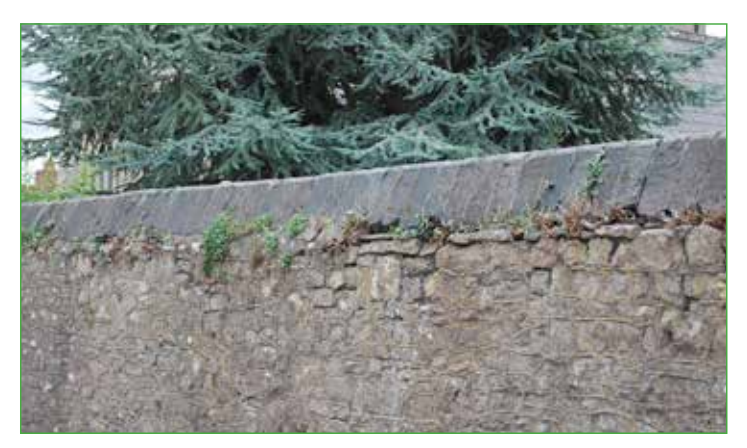
Traditional slag coping to wall top

Due to the history of the village, in particular the area around Olveston Court, it is a valuable source of archaeological information. Where development is proposed applicants will be expected to assess the archaeological significance of the site and assess the impact of proposals on that significance.