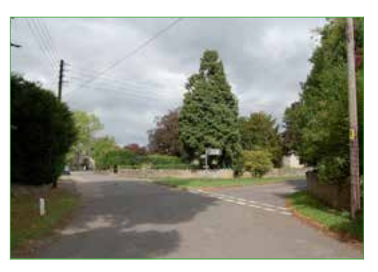
Top left : Hill House, The Green. Top right : Traditional coach house doors and shutters. Bottom left : The duck pond. Bottom right : The Green.