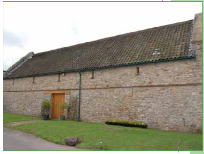
A high quality barn conversion has retained the agricultural character at this part of The Green.