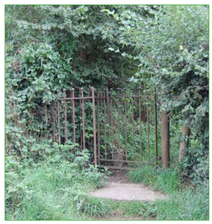
Historic kissing gate on Haw Lane at the entrance to the Eastcombe Hill PROW.

To the southern side of Haw Lane there are far fewer properties, and these mostly date from the 20th century, although the dwelling known as The Yard was originally a barn which belonged to the Haw Farm. It is important that the rural setting and tranquil character of Haw Lane is protected and views to Eastcombe Hill are maintained and therefore proposals for further development on the south side of the lane will be resisted where this would not achieve this aim. The regular development 'grain' and building line, and the spacious and green garden plots to the northern side should also be maintained.