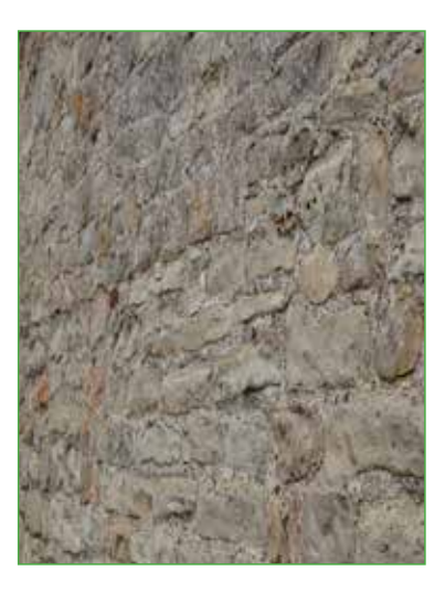
Top right: Traditional stone porch, vicarage Top left: The War memorial outside St Mary's Church Middle right: A traditional pump on Church Hill Bottom left: Traditional stile at The Green Bottom right: Lias stone walling