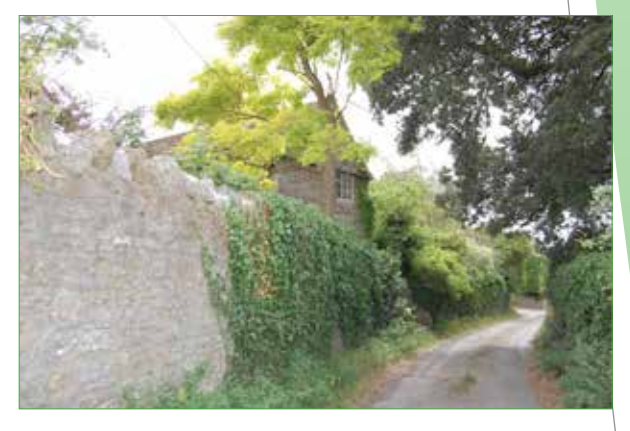
Ley Lane characterised by stone wall, informal verges and tree planting