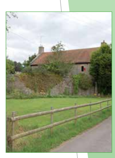
Bee Garden at Olveston