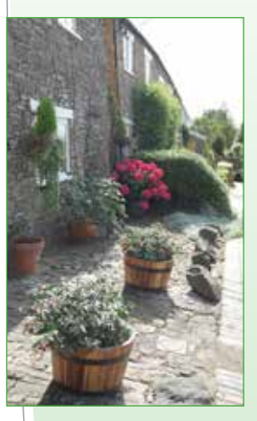
Maintain traditional stone sett verge