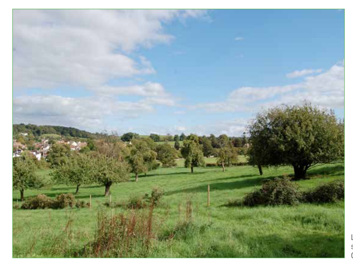
Land to the south west of Olveston Court

The Council is keen to work with the local community and other parties to help preserve and enhance this special area. The strategy sets out way we can help to achieve this. If you wish to assist in any manner or have any further suggestions, please let us know.