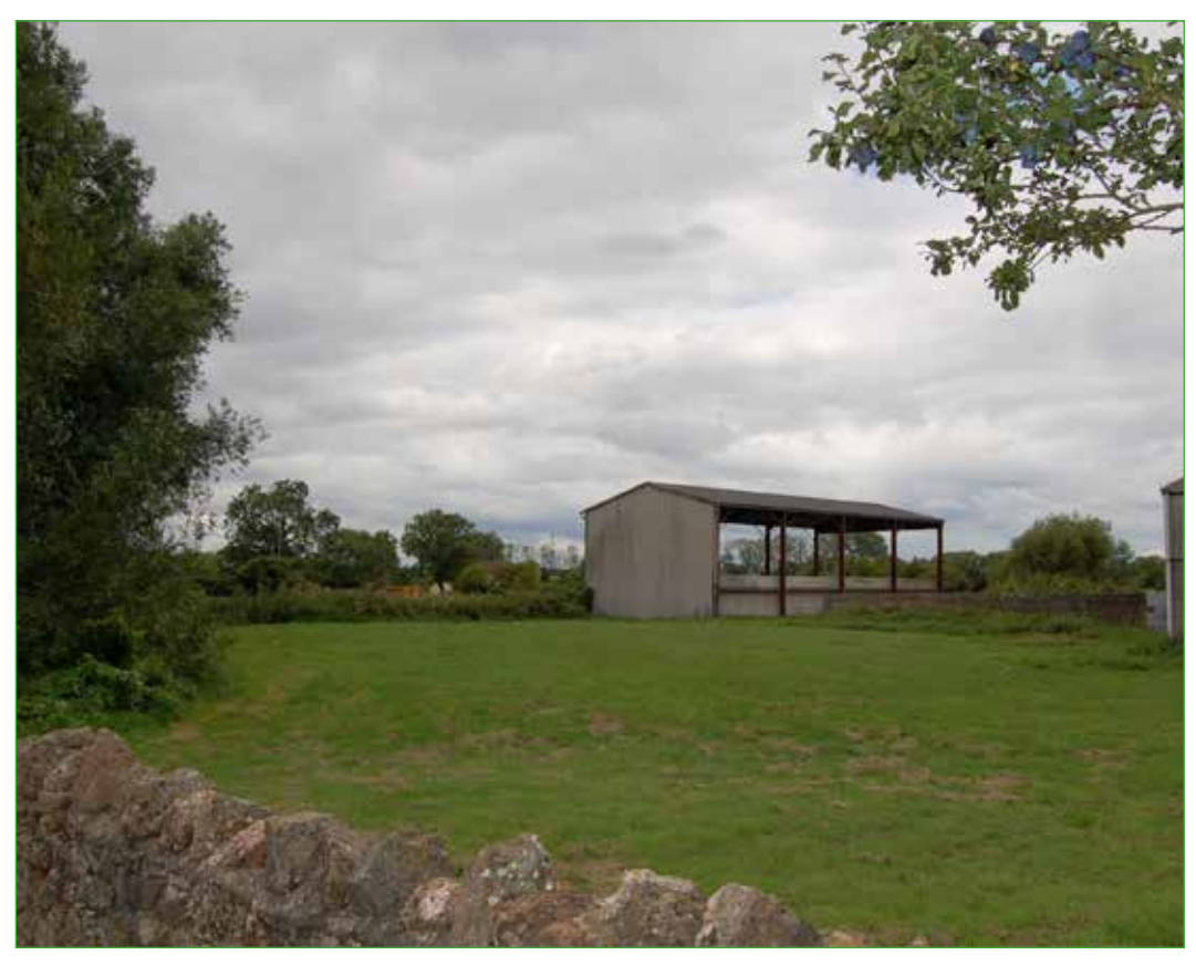
Views to the open countryside at the end of Denys Court