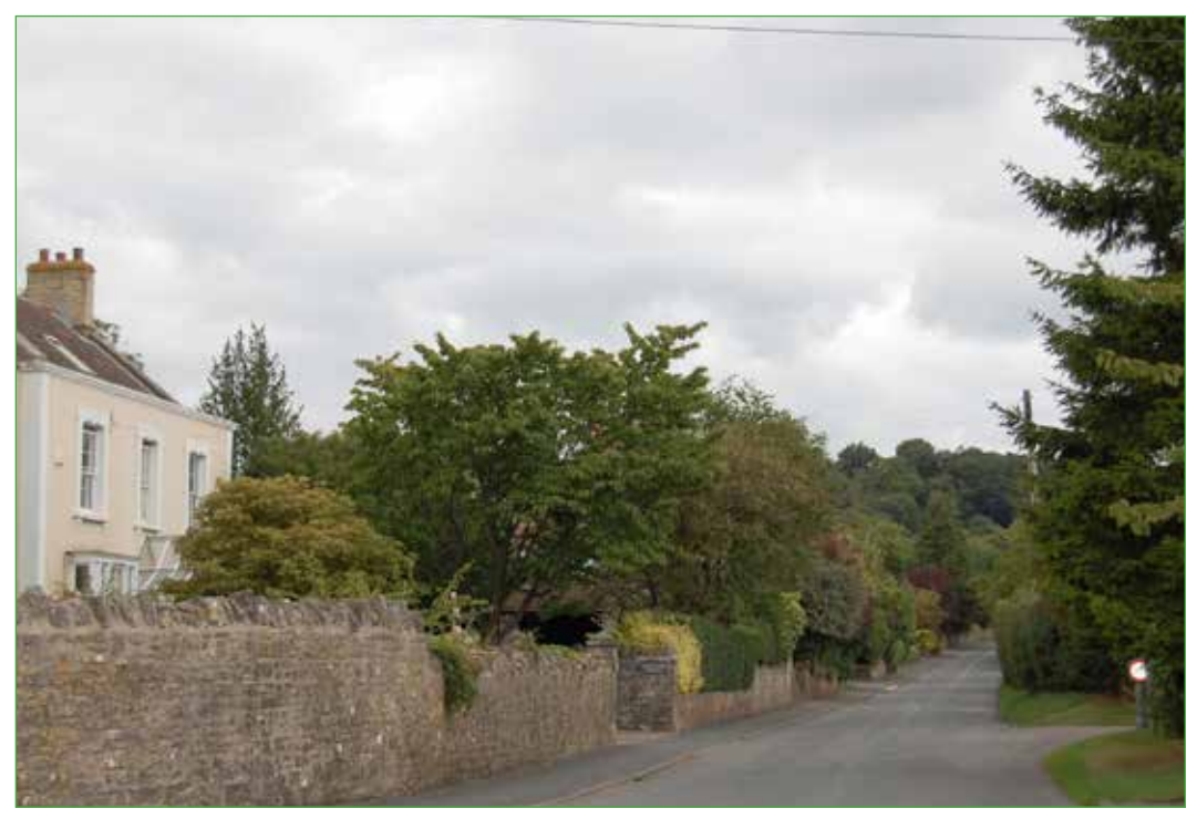
Haw Lane—characterised by it's high level of enclosure and greenness provided by the walls and tree and hedge planting

These 18th and 19th century buildings share stylistic characteristics of the polite style of architecture which is seen elsewhere in the conservation area. They are set back from the road within large garden plots, enclosed by high stone walls. The front elevations are often symmetrically arranged and rendered, with sash windows. Many also have ornate canopied porches and coped parapets to the buildings and the boundary walls. Granville Lodge, Hawkfield House and Hawleaze are statutory listed for their architectural and historic interest and Longleaze is locally listed. Whilst some minor modern alterations have taken place, the historic buildings on Haw Lane have well preserved traditional exteriors and contribute positively to the street scene. The front gardens and planting provide a green and leafy character, and the stone boundary walls at the road frontage create a strong boundary edge and sense of enclosure, although this is interrupted at the access to Orchard Rise.