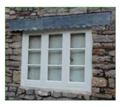
Traditional flush timber casement