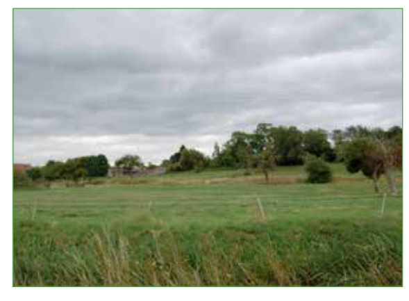
The open landscape setting around Olveston Court