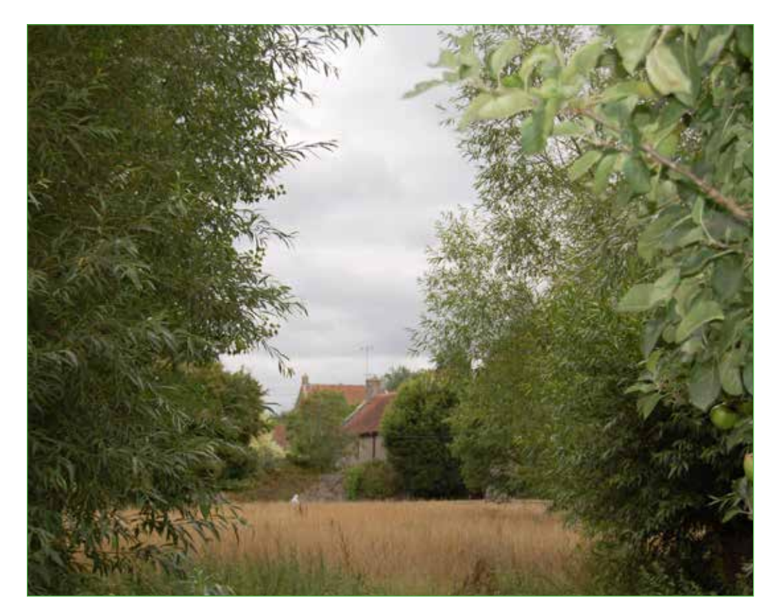
Olveston Court viewed in an open setting

The Court is located on the north-east slopes of Catherine Hill, to the south west of the village. The present building includes a massive, crenellated, moated curtain wall with a gatehouse at its eastern end and a further stretch of wall east of the gatehouse incorporated into later buildings. A further 10 metre stretch of crenellated wall returns north at the western end and is all that remains of a curtain wall to the outer court which would originally have enclosed a large area of land to the north of the gatehouse. These fortifications were a symbol of status rather than having defensive value. The Court was originally approached from the south, but after the Green was enclosed in the 19th century access became via the service courtyard from the main village street, and now from Denys Court. The impressive gatehouse no longer forms the grand entrance to the site which it once did.