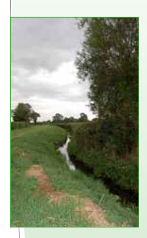
Rhines are important landscape features and also of ecological value, providing habitat for a variety of wildlife species.