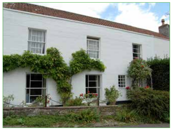
A well preserved example of a 'polite' building

Other than some views of the modern development extending from New Road, The Green has very few negative elements. However this means that it is very sensitive to change and it is important that further modern development does not impinge on the well preserved and tranquil character of this area. Development within these open spaces will be strongly resisted, and alterations to existing properties must preserve the traditional character and integrity of the buildings and spaces in this area.