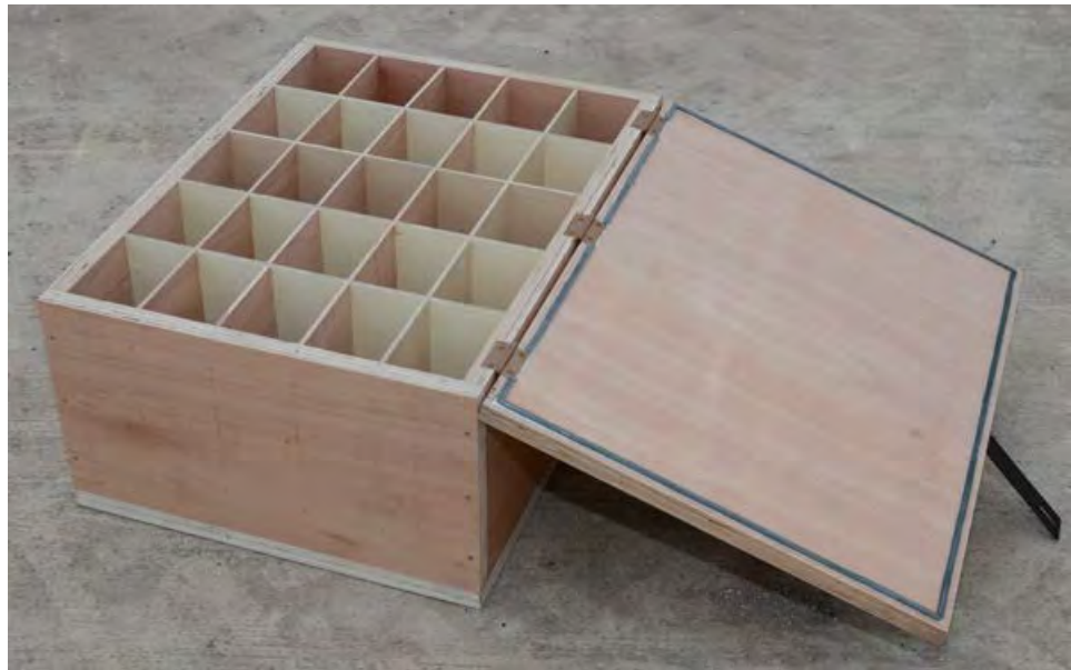
Figure 1 Storage of shooters' powder. Note intumescent strip on box lid

10 Boxes constructed in line with the findings presented in HSE research report RR991 5 can be used for the storage of between 1 and 25 (5x5) containers without being type tested. They are expected to provide at least eight minutes of fire protection to a box that is involved in a major conflagration.