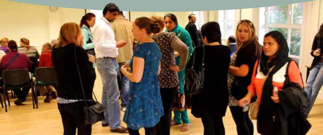
People arriving for our annual learner celebration event