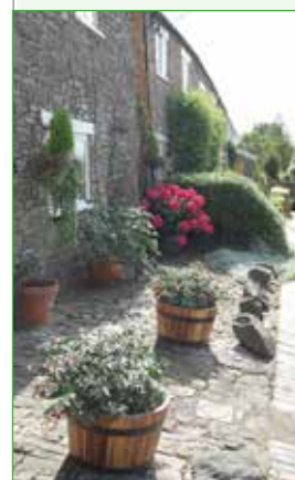
Maintain traditional stone sett verge

In comparison to the level route through the village, the lanes follow the sloping ground. Church Hill drops steeply towards the flood plain of the River Severn at its lower end, whilst Vicarage Lane rises gradually at first, before a steep climb up Fern Hill. It is thought that there may historically have been a quarry on the site of Church Hill which would explain the steepness of the slope here. The meandering nature of the lanes, their varied levels and the seemingly random orientation and layout of buildings results in a variety of spaces and a mixture of short and longer distance views. From elevated positions on Church Hill interesting framed views out to the levels can be glimpsed. The variety of both high levels of enclosure and open views also adds interest and character to the lanes. For example the wide road and verge at the top of Church Hill gradually reduces to the narrow and enclosed pinch point half way down at its steepest point, and beyond this the character changes dramatically at the bottom of the hill where extensive views towards the Severn Levels are achieved across the open fields.