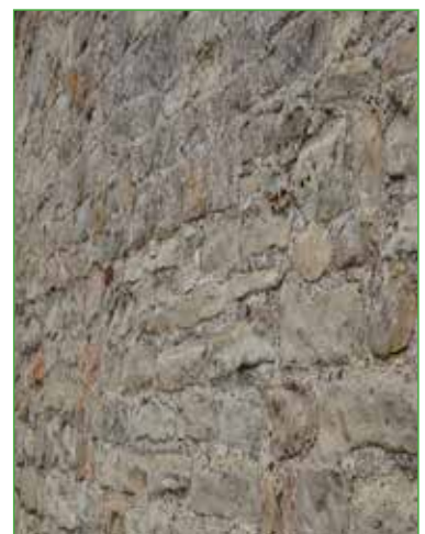
Top right: Traditional stone porch, vicarage Top left: The War memorial outside St Mary's Church Middle right: A traditional pump on Church Hill Bottom left: Traditional stile at The Green Bottom right: Lias stone walling