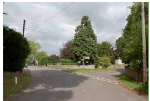
Top left: Hill House, The Green. Top right: Traditional coach house doors and shutters. Bottom left: The duck pond. Bottom right: The Green.