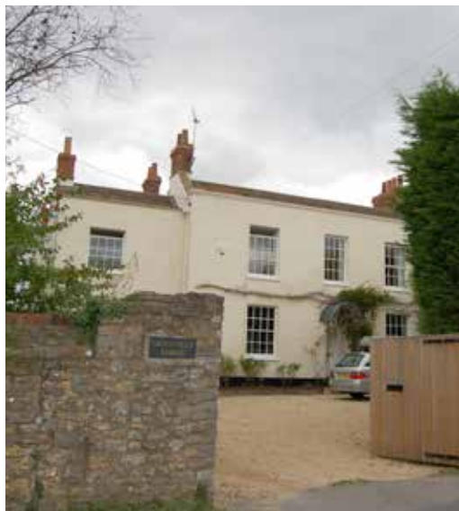
Below right: The high stone boundary walls of The Old Vicarage