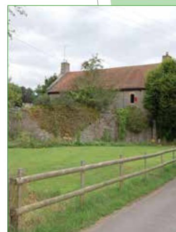
Bee Garden at Oveston Court

Rhines are important landscape features and also of ecological value, providing habitat for a variety of wildlife species.