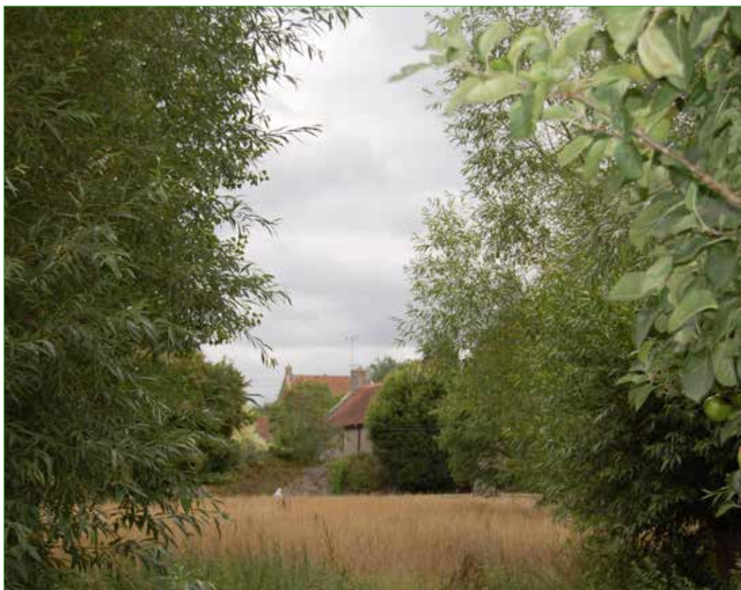
Olveston Court viewed in an open setting

The Court is located on the north-east slopes of Catherine Hill, to the south west of the village. The present building includes a massive, crenellated, moated curtain wall with a gatehouse at its eastern end and a further stretch of wall east of the gatehouse incorporated into later buildings. A further 10 metre stretch of crenellated wall returns north at the western end and is all that remains of a curtain wall to the outer court which would originally have enclosed a large area of land to the north of the gatehouse. These fortifications were a symbol of status rather than having defensive value. The Court was originally approached from the south, but after the Green was enclosed in the 19th century access became via the service courtyard from the main village street, and now from Denys Court. The impressive gatehouse no longer forms the grand entrance to the site which it once did.