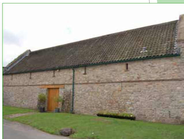
A high quality barn conversion has retained the agricultural character at this part of The Green.