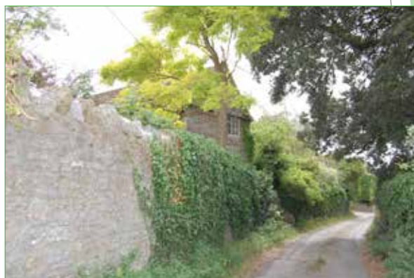
Ley Lane characterised by stone wall, informal verges and tree planting