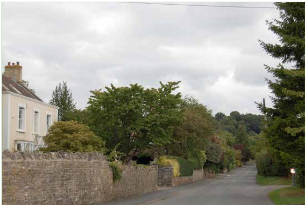
Haw Lane—characterised by it's high level of enclosure and greenness provided by the walls and tree and hedge planting

These 18th and 19th century buildings share stylistic characteristics of the polite style of architecture which is seen elsewhere in the conservation area. They are set back from the road within large garden plots, enclosed by high stone walls. The front elevations are often symmetrically arranged and rendered, with sash windows. Many also have ornate canopied porches and coped parapets to the buildings and the boundary walls. Granville Lodge, Hawkfield House and Hawleaze are statutory listed for their architectural and historic interest and Longleaze is locally listed. Whilst some minor modern alterations have taken place, the historic buildings on Haw Lane have well preserved traditional exteriors and contribute positively to the street scene. The front gardens and planting provide a green and leafy character, and the stone boundary walls at the road frontage create a strong boundary edge and sense of enclosure, although this is interrupted at the access to Orchard Rise.