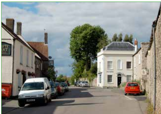
The street - looking towards The Old Post Office and the White Hart Public House

This character area includes the principal route through the village, which follows the historic coaching route from Bristol to the Aust Ferry. Until the early 20th century the village of Olveston comprised two distinct clusters of development, one to the north which centred on the crossroads at the church and that to the south around the village green, with only limited development in between. New Road, constructed in 1805 to improve the coaching route, served from this time on as the principal route in to the village from the south. Modern infill along New Road and The Street has served to link the two historic areas and created the predominantly linear form of the village we see today.