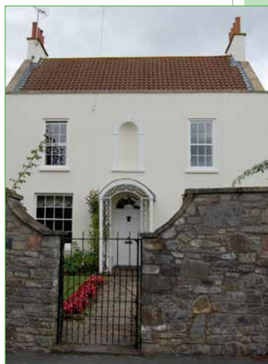
Hawkfield House is a grade II listed building of 'polite' style