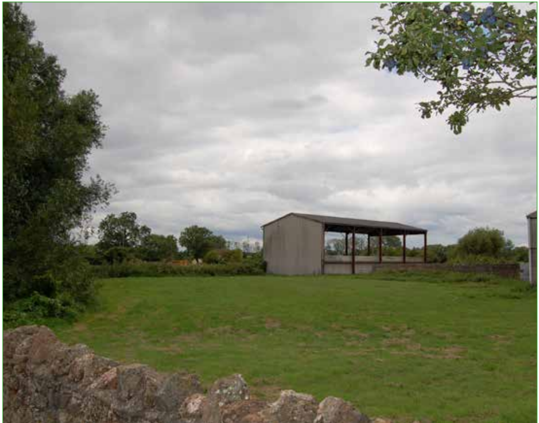
Views to the open countryside at the end of Denys Court