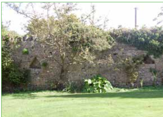
The distinctive bee boles at Olveston Court

The cumulative impact of seemingly small changes such as additional sub-division of open fields, the erection of small outbuildings, non-native planting or unsympathetic extensions and alterations to buildings can harm the unique character of the area. Due to the site's fragmented ownership, the