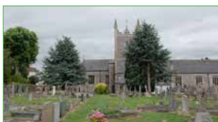
Bottom left: Traditional cottages on New Road and the Methodist Chapel.