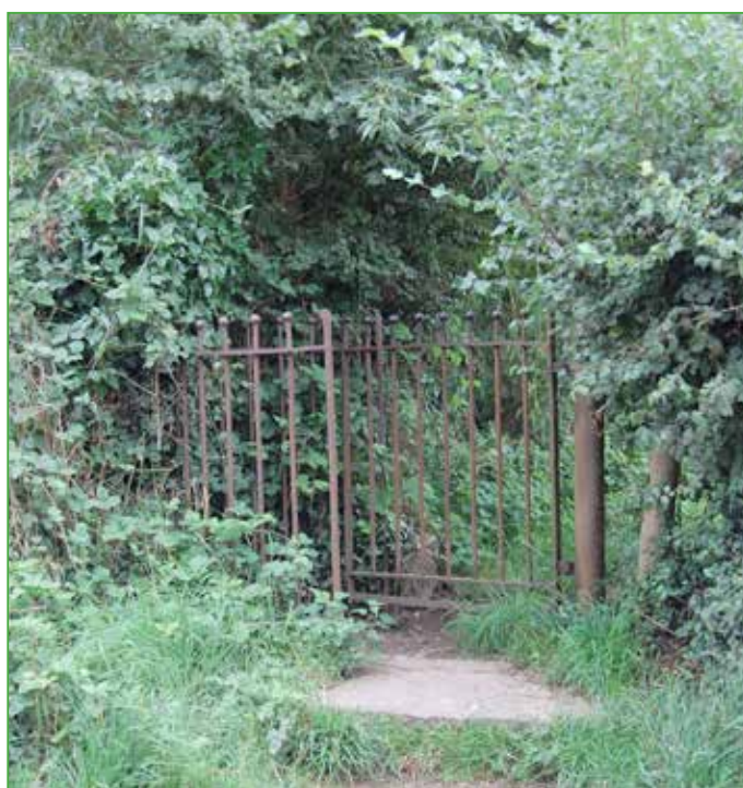
Historic kissing gate on Haw Lane at the entrance to the Eastcombe Hill PROW.

To the southern side of Haw Lane there are far fewer properties, and these mostly date from the 20th century, although the dwelling known as The Yard was originally a barn which belonged to the Haw Farm. It is important that the rural setting and tranquil character of Haw Lane is protected and views to Eastcombe Hill are maintained and therefore proposals for further development on the south side of the lane will be resisted where this would not achieve this aim. The regular development 'grain' and building line, and the spacious and green garden plots to the northern side should also be maintained.