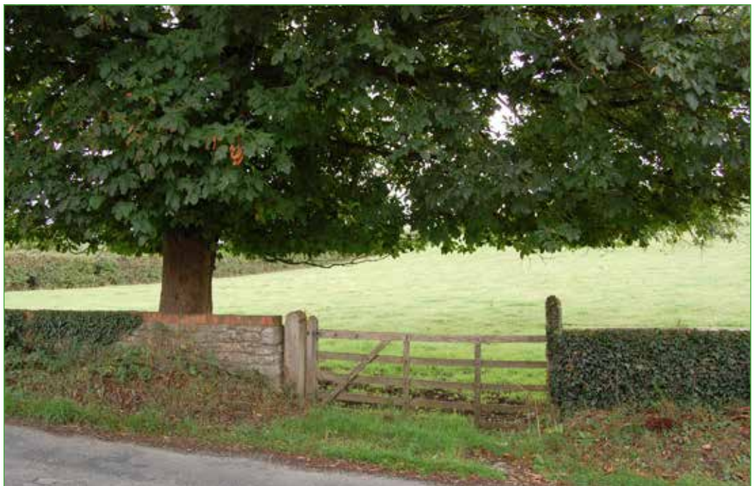
The tree planting and landscape setting contribute to the character of Haw Lane