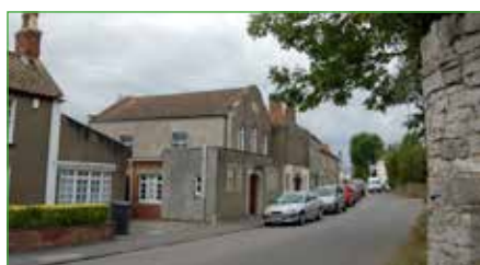
Top right: Traditional cottages on The Street