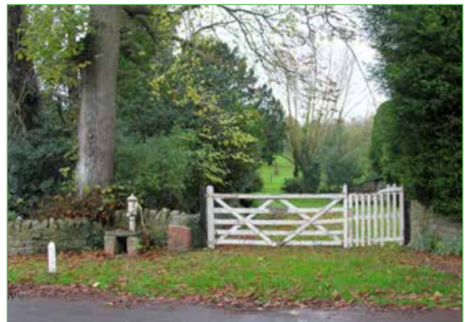
Features such as the pump, informal verges, stone boundary walls, trees and simple gateway contribute to the rustic character