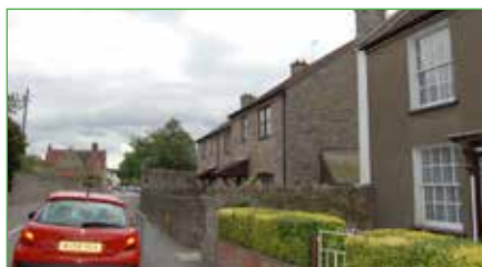
Top left: A section of the distinctive high stone walling on The Street