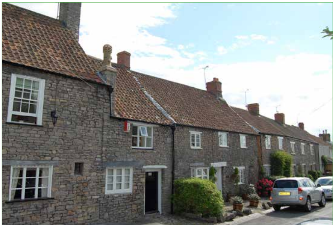
The cottages opposite St Mary's Church are reputed to be some of the oldest buildings in the village

The agricultural buildings associated with Church Farm enhance the traditional rural character and the informality of this character area. The modern cul-de-sac development at the lower end of Church Lane as well as the water pumping station, have however diminished the traditional rural character and it should be ensured that further development does not further detract from its rural character and open landscape setting. The overhead power lines on Church Hill are also particularly prominent and detract from the rural charm.