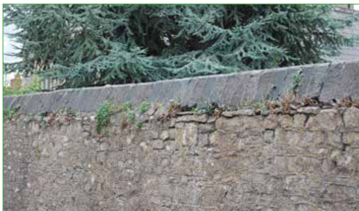
Traditional slag coping to wall top

Due to the history of the village, in particular the area around Olveston Court, it is a valuable source of archaeological information. Where development is proposed applicants will be expected to assess the archaeological significance of the site and assess the impact of proposals on that significance.