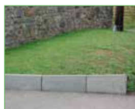
Inappropriate verge treatment