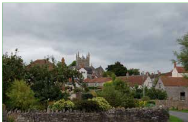
Preserve views to St Mary's Church