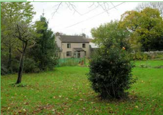
The large front gardens provide an important sense of space and tranquillity to the area and should not be developed or harmed