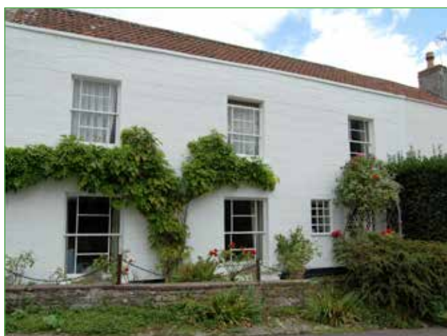
A well preserved example of a 'polite' building

Other than some views of the modern development extending from New Road, The Green has very few negative elements. However this means that it is very sensitive to change and it is important that further modern development does not impinge on the well preserved and tranquil character of this area. Development within these open spaces will be strongly resisted, and alterations to existing properties must preserve the traditional character and integrity of the buildings and spaces in this area.