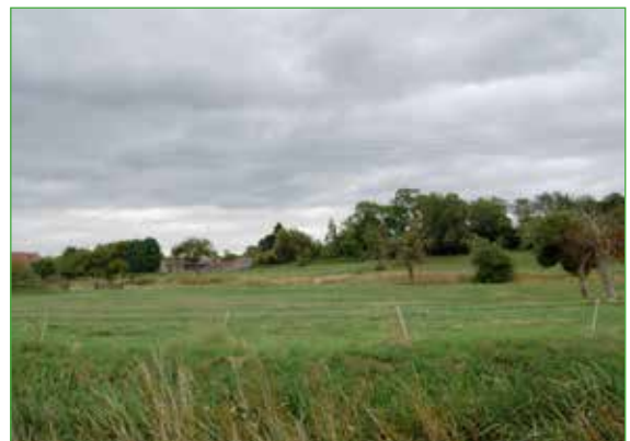
The open landscape setting around Olveston Court