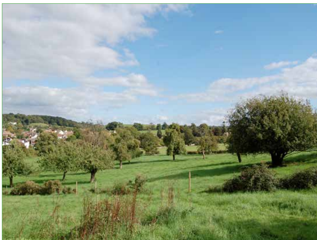
Land to the south west of Olveston Court

The Council is keen to work with the local community and other parties to help preserve and enhance this special area. The strategy sets out way we can help to achieve this. If you wish to assist in any manner or have any further suggestions, please let us know.